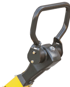
Precise and save to operate Comfortable control lever